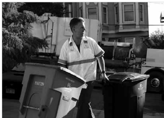
Recology's recycling program has helped the city achieve a 77 percent diversion rate – the highest in the nation, making San Francisco the country's recycling leader.