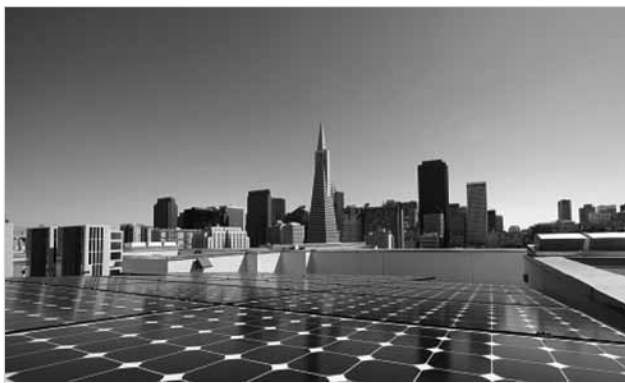
This solar electric system at a condominium complex in North Beach is one of many solar installation projects from Luminalt Energy Corporation.

Visit the Chamber's online Business Directory at www.sfchamber.com to find more members driving the clean energy economy.